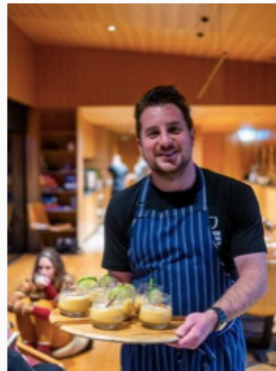
Dining on the Wild Wellness walk.

Our destination on day two is the lodge near Cape Pillar, 11km down the track. As we journey through a landscape shaped by wind and fire, we are met by views that stretch from Bruny Island in the south to Freycinet in the north. The geology in this part of Tasmania is related to the rocks of the Grand Canyon and the sense of time and interconnection is tangible. We walk through cloud forests, where the cliffs funnel cold air from the ocean and then, in quick contrast, areas of impenetrable, waist-high scrub that provides cover for the many (invisible, apart from their distinctive cubed droppings) wombats.