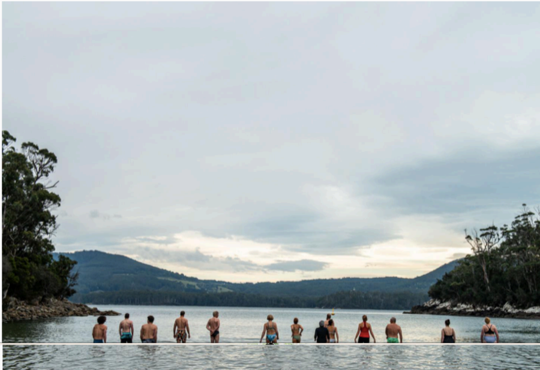
Taking a dip on the Wild Wellness Method walk with Tasmanian Walking Co.