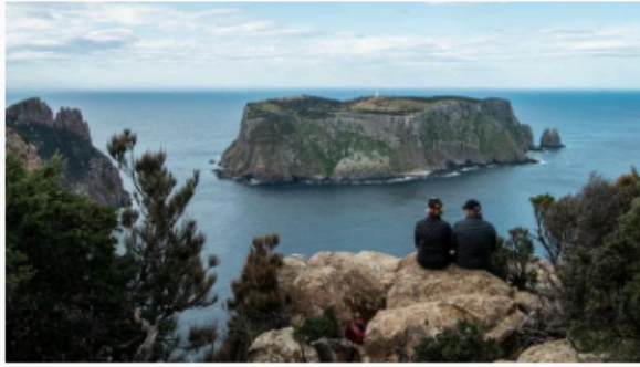
Tasman Island with its remote lighthouse station.

The group splits into two to climb rock-cut steps to The Blade, a jutting promontory that gloriously exposes you to all the elements. Later that afternoon, another breathwork and immersion session loosens stiff muscles and centres racing minds.