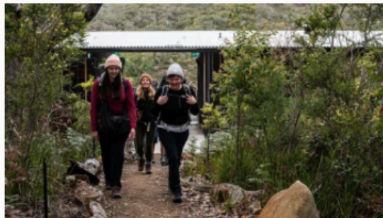
Setting out for the day's walk.